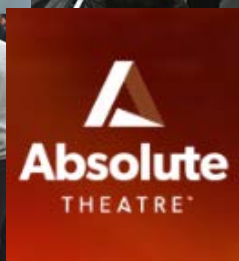
Absolute Theatre Coming November 11 CLICK