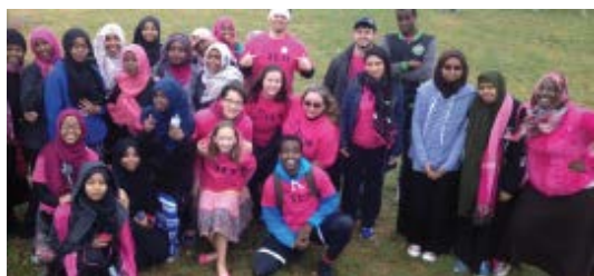
Breast Cancer Walk October 22