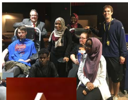
Blood Drive October 24