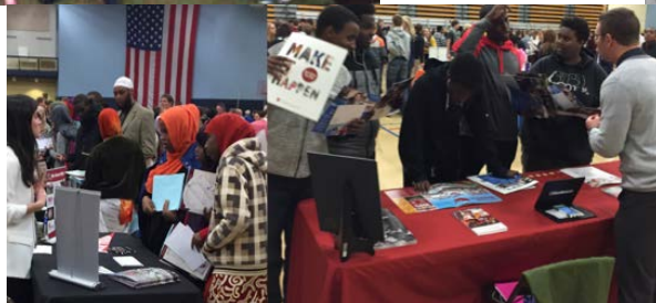
College Fair RCTC October 27